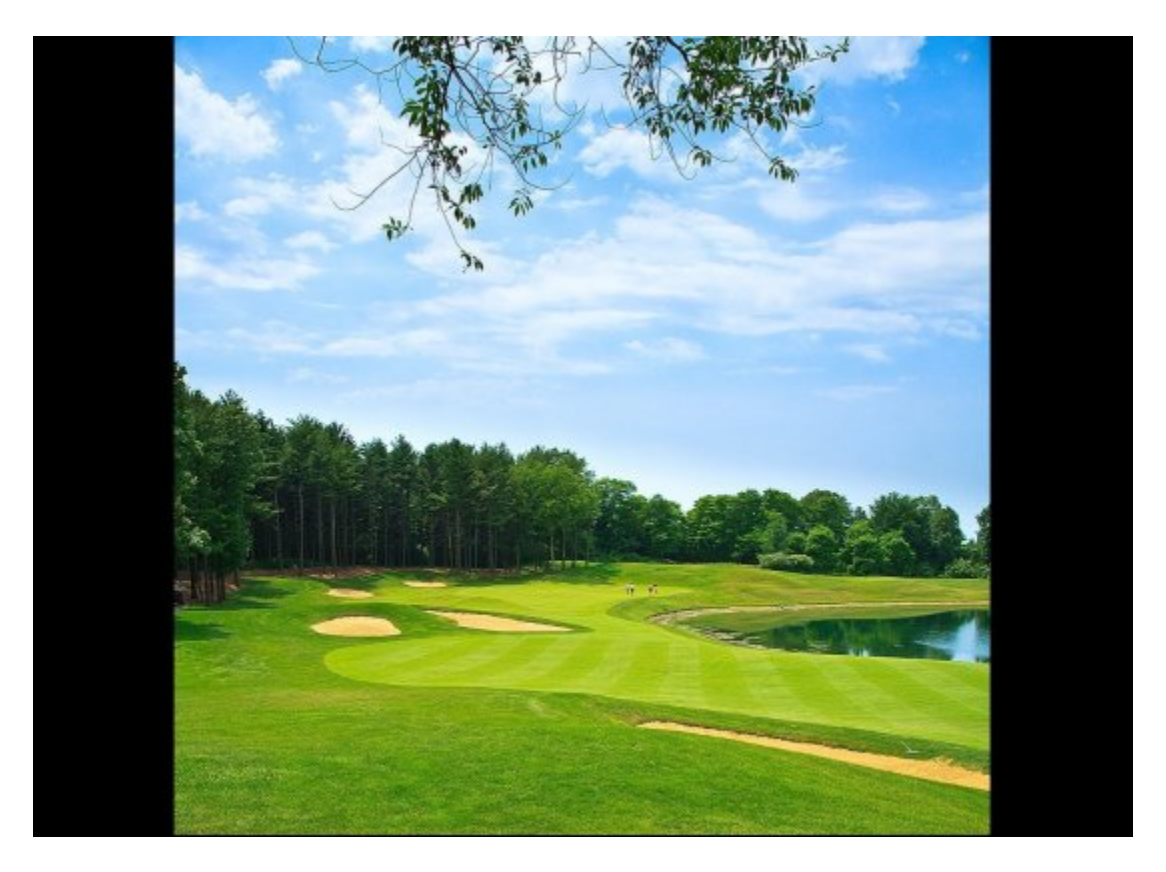
A Golfer's Dream. Most people don't think of Detroit as a green golfing mecca but it boasts more than 35 places to tee up within a 20 mile range of the city.