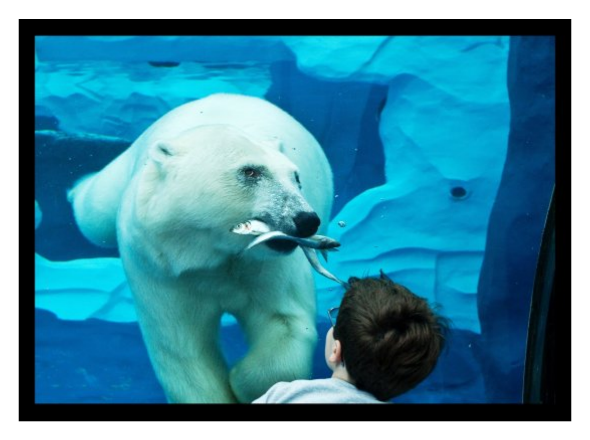
World-Class <u>Detroit Zoo.</u> 125 acres, 3300 animals, 1.1 million visitors a year. Where else can you see polar bears swim under water in a simulated arctic tundra?